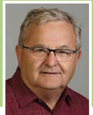
Les Windjue District 3